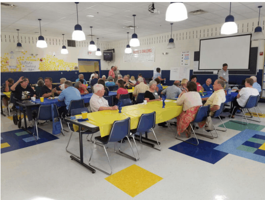
Attendees at our Annual Meeting - 2016