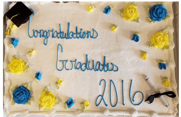
Celebrating with dessert!