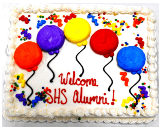
Celebrating with dessert!