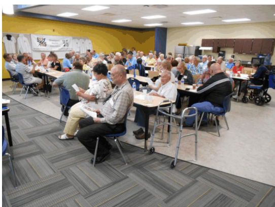
Attendees at our Annual Meeting - 2017