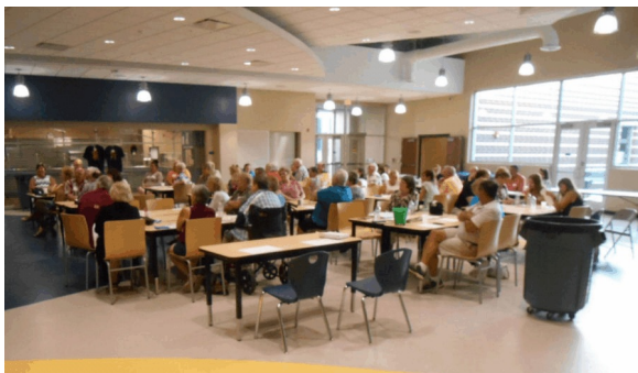
Attendees at our Annual Meeting - 2018