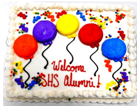
Celebrating with dessert!