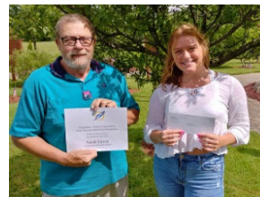
Gene Newton Scholarship $250