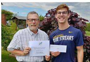
Clem Yaskowitz Scholarship $1,000