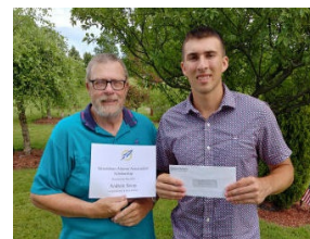
Streetsboro Alumni Association Scholarship $250