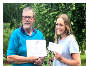
Streetsboro Alumni Association Scholarship $250