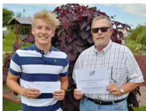
Streetsboro Alumni Association Scholarship $250