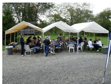
Class of 1969 Sunday afternoon picnic at Holly's in Mantua