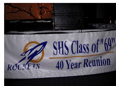
Class of 1969 Banner