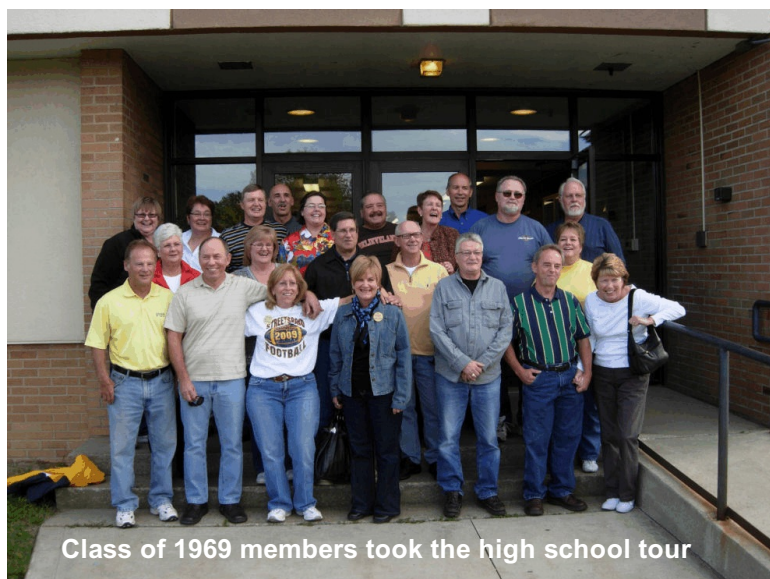
Class of 1969 members took the high school tour